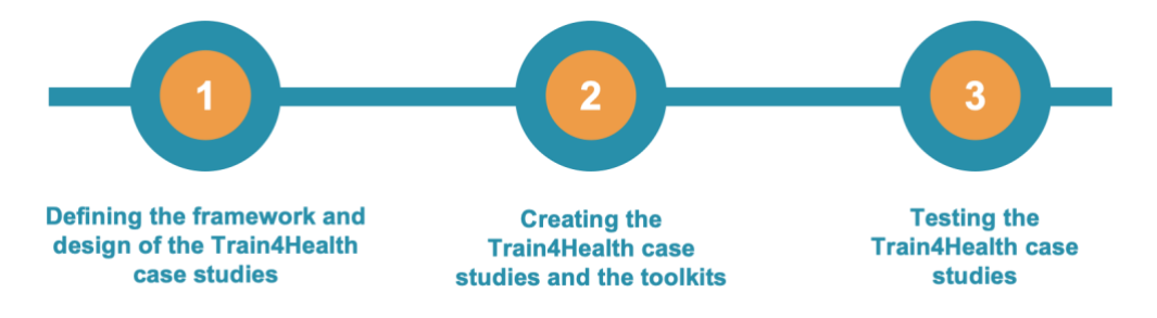
Figure 2 | Stages of development of the case studies

The development of the Train4Health case studies was an iterative process, involving different partners and external stakeholders' consultations, to assure high-quality outputs, as close as possible to real life cases of persons with chronic diseases. As depicted in Figure 2, three stages were followed to develop the case studies, which are described in the next sections.